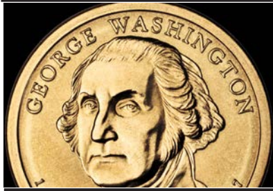
Trenton Numismatic Club